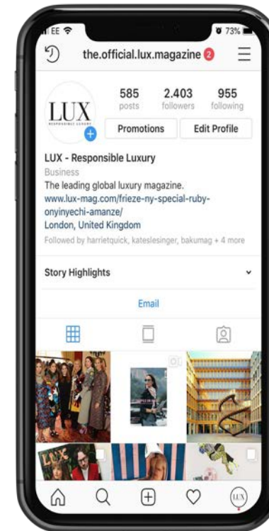
Social Media @luxthemagazine